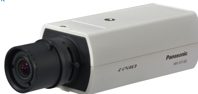
Lens : Optional